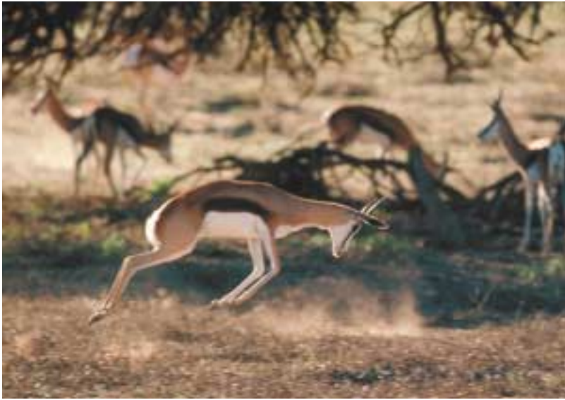
Figure 2. Stotting by a springbok antelope in front of a predator signals the animal's ability to escape. This behavior is too costly to fake by a weakened antelope, so it provides honest information about the animal's strength and speed. Similarly, human religious rituals that require an extreme display or a personal sacrifice are "too costly to fake" and so serve as honest signals of the member's dedication to the group.

tual beliefs were indicative of a primitive and simple mind. In the 19th century, Edward B. Tylor, often noted as one of the founding fathers of anthropology, maintained that religion arose out of a misunderstanding among "primitives" that dreams are real. He argued that dreams of deceased ancestors might have led the primitives to believe that spirits can survive death.